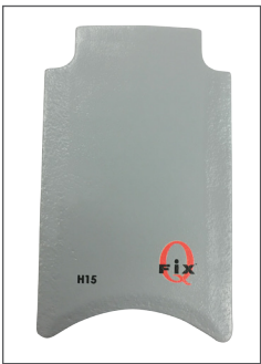
15 mm headrest