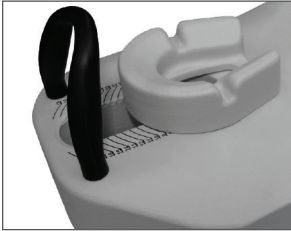
Shown with Prone Headrest